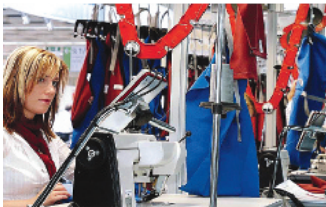
The SPESA show at the Georgia World Congress Center.