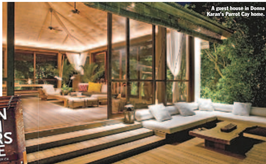
A guest house in Donna Karan's Parrot Cay home.