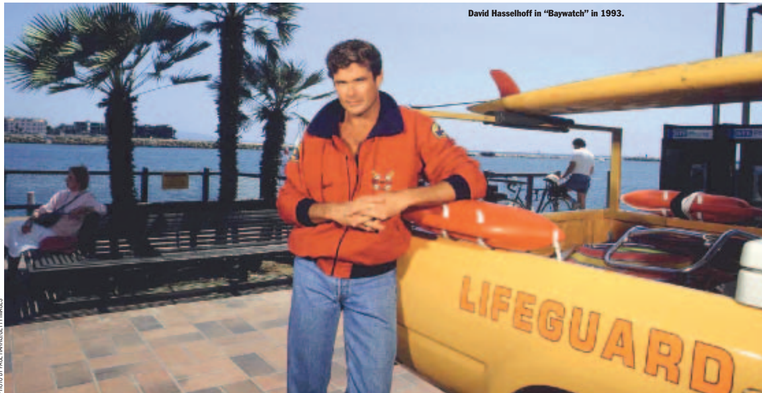
David Hasselhoff in "Baywatch" in 1993.

"There will be certain strategic deals that make sense for companies to do as they leverage their global plat-