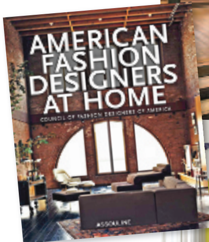
The book's cover.

In September, the CFDA will publish with Assouline "American Fashion Designers at Home," a coffee-table book that will feature images of homes from some 115 of its members, including Carolina Herrera's opulent Upper East Side digs, Donna Karan's Zen-like Parrot Cay retreat and Josie Natori's Paris pied-à-terre.