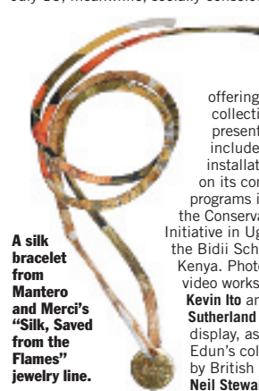
A silk bracelet from Mantero and Merci's "Silk, Saved from the Flames" jewelry line.