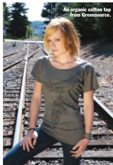
An organic cotton top from Greensource.