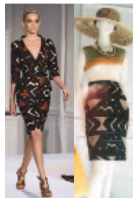
The looks from Oscar de la Renta and Max Mara Studio.