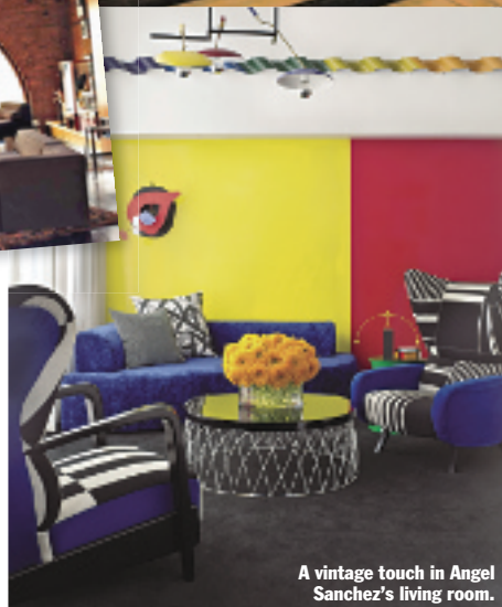
A vintage touch in Angel Sanchez's living room.