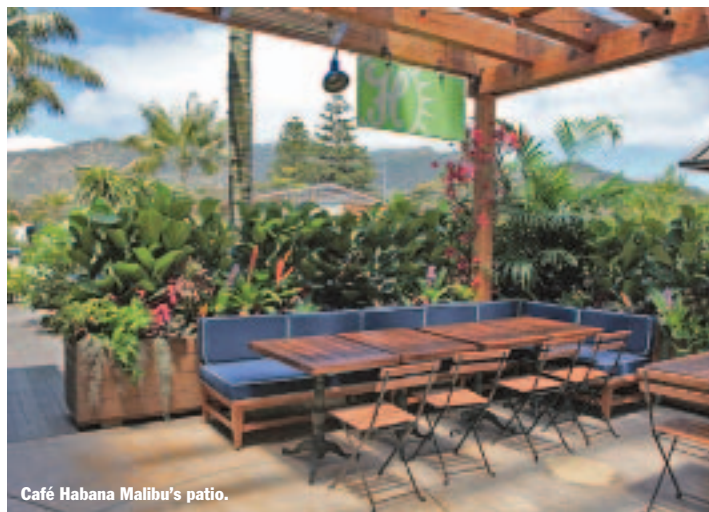
Café Habana Malibu's patio.