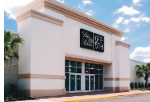
Saks’ Off 5th concept.

The main guessing game at ReCon focused on which retailers are going to make the most out of the current economic circumstances. Value and fast-fashion retailers and department stores, including Forever 21 , Dollar Tree , TJX , Ross and Kohl’s , and the off-price formats of Saks , Bloomingdale’s , Nordstrom , Lord & Taylor and Neiman Marcus , were mentioned as the primary growth drivers.