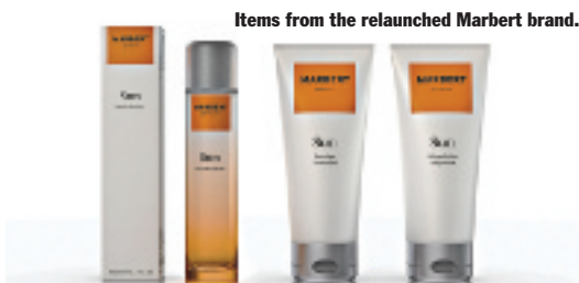
Items from the relaunched Marbert brand.

BBI, which has offices in Baden-Baden, Germany, and Salzburg, Austria, has opened a training center in Baden-Baden, where its retail partners can get informed about all the firm's brands. BBI also will offer regional workshops on selling in the entry-level price segment. Retailers also will be provided with