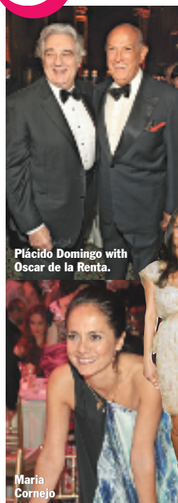
Plácido Domingo with Oscar de la Renta.